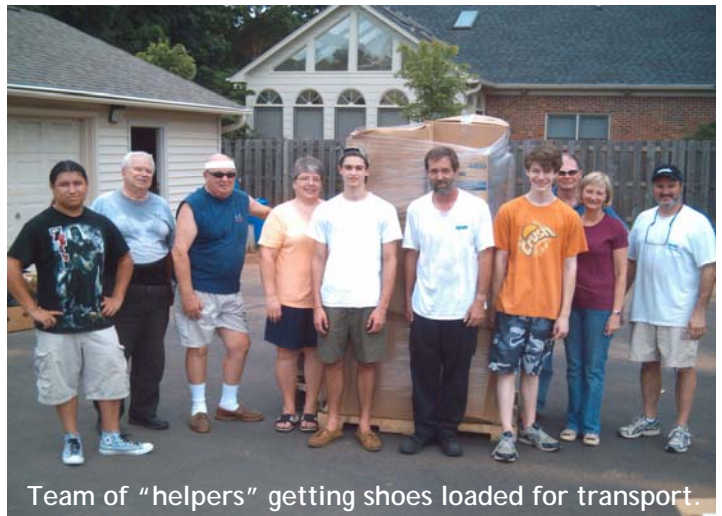
Team of "helpers" getting shoes loaded for transport.

OOPS! Mission Support contributions help to fund 27 colleges and universities, such as Lenoir-Rhyne University in Hickory, the only Lutheran college in North Carolina. It also assists camping and conference centers like Agape+Kure Beach Ministries and Lutheridge+Lutherock Ministries, but they are not one of the Lutheran colleges and universities as mentioned in the last newsletter.