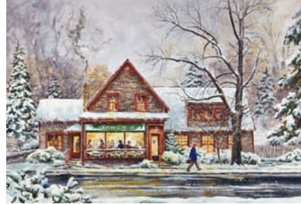
Greensboro Urban Ministry 2009 Honor Card

COMING SOON: Angel Tree and Honor Cards! Stay tuned for details.